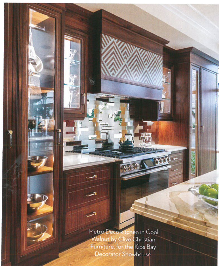
Metro Deco kitchen in Cool Walnut by Clive Christian Furniture, for the Kips Bay Decorator Showhouse